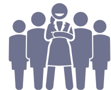
Women in Leadership Forum

Coordinated by the IHF Secretariat, our activities and services focus on themes to tackle the most important issues facing hospitals right now, such as sustainability, harnessing big data, and telehealth.