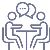
Special Interest Groups