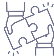
Advocacy through partnerships