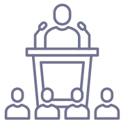
World Hospital Congress