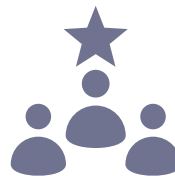
Young Executive Leaders